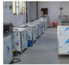
3 Product test