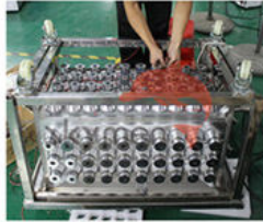
4 Transducer Installation