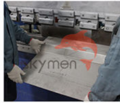
2 Board Cutting