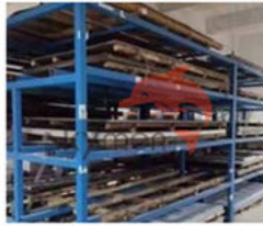
1 Raw Material