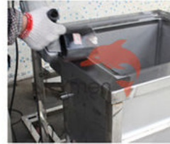
6 Tank Polishing