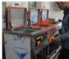
8 Age Testing