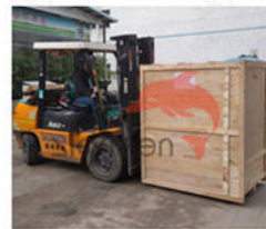
9 Skymen Factory Shipping