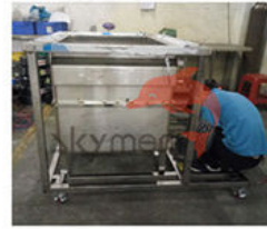
3 Tank Welding